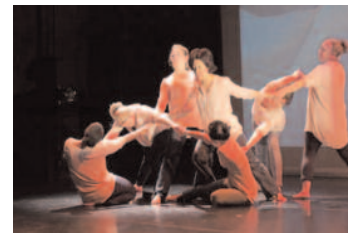
Continuum Dance 'skin/ skin', 2015-2016 season