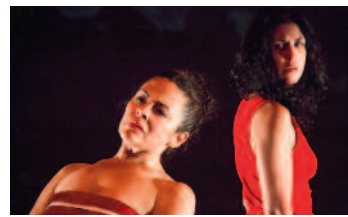
Blood from Stone