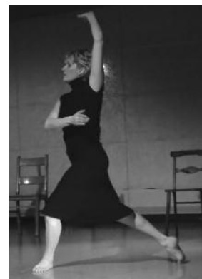
The Place Between