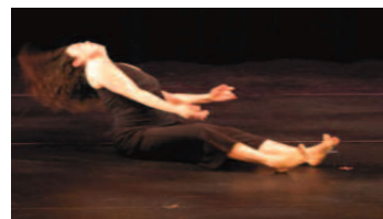
Sometimes it never leaves your skin