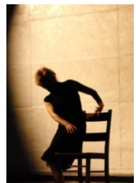
The Place Between